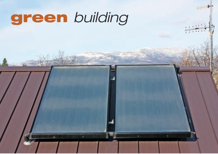
Two solar thermal collectors offset 68% of water-heating energy loads.

tightly constructed, with little air exchange between the inside and outside. The American Society of Heating, Refrigeration, and Air-Conditioning Engineering provides procedures for determining whole-house ventilation rates in its standards.