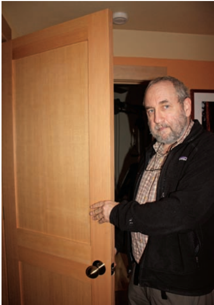
Fiber-core interior doors with FSC-certified wood veneers are tasteful, sustainable choices.