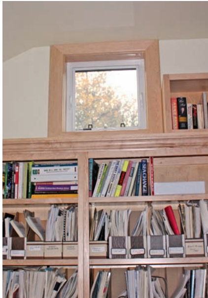
Operable windows placed high in the second-floor rooms provide ventilation using natural convection.