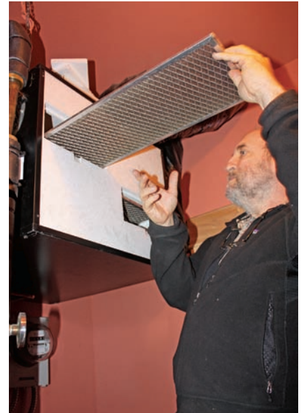
An energy recovery ventilator introduces fresh, conditioned air into the well-sealed home, with little heat loss.

The envelope is a complex unit, typically made up of several materials—siding, sheathing, windows and doors, framing, insulation, and drywall—and whole-wall R-values will give a more accurate picture of the home's thermal performance than just looking at the value of the insulation within the walls. While Energy Star recommendations provide a starting point, Oak Ridge National Laboratories whole-wall R-value calculator can help you quantify your choices.